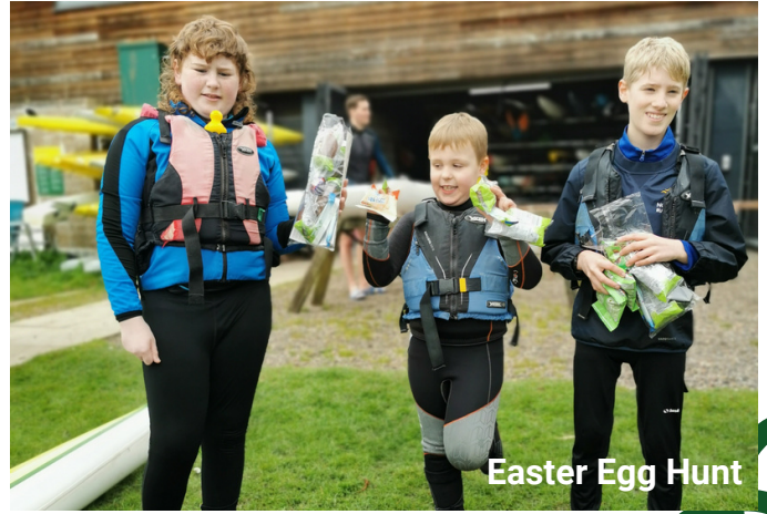
Easter Egg Hunt